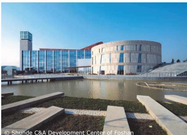
© Shunde C&A Development Center of Foshan