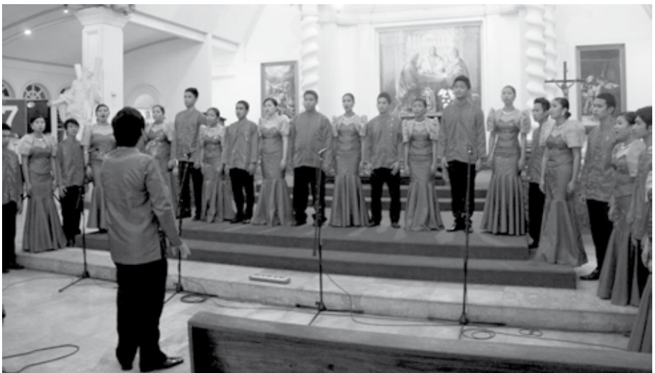
CORO OBCENTO Quezon City, Philippines