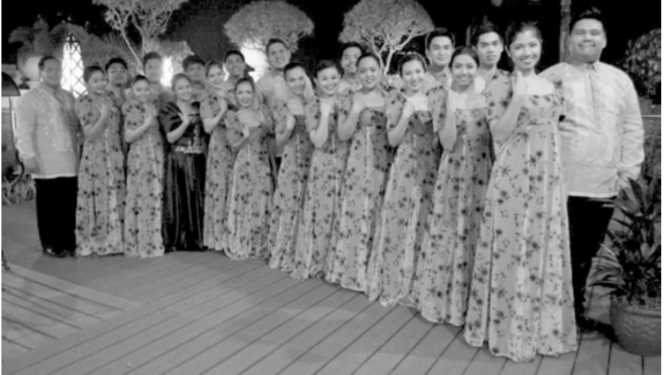
CORO SAN BENILDO Manila, Philippines