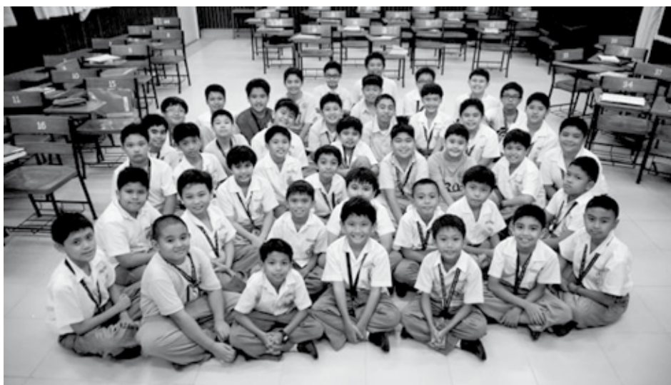
ATENEO BOYS CHOIR Quezon City, Philippines