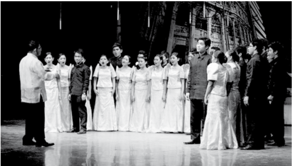
TECHNOLOGICAL INSTITUTE OF THE PHILIPPINES CHORAL SOCIETY Quezon City