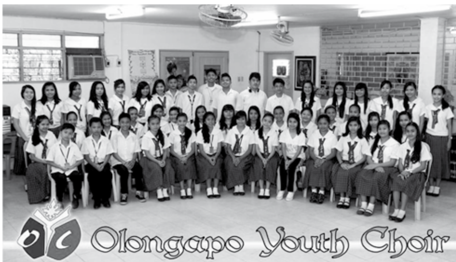
OLONGAPO YOUTH CHOIR Olongapo City, Philippines