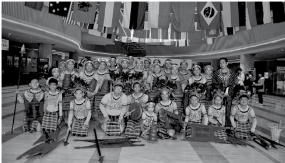
CALASIAO CHILDREN'S CHORUS Calasiao, Pangasinan, Philippines