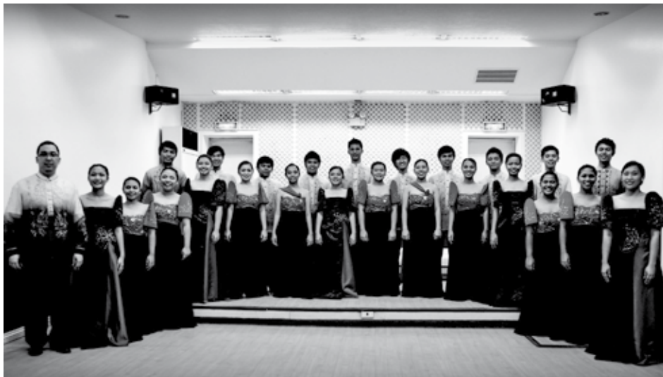
MAPÚA CARDINAL SINGERS Manila, Philippines