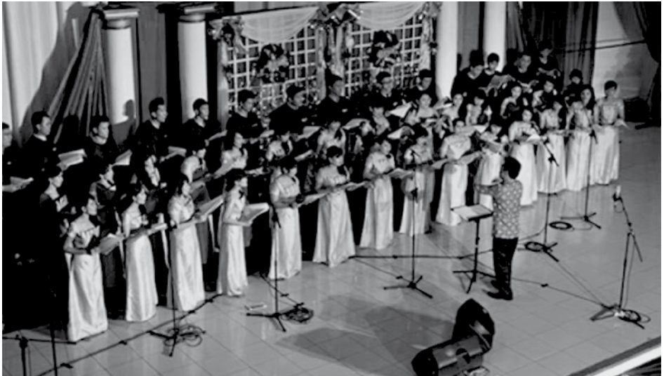
CONCORDIA CHOIR UNIV. HKBP NOMMENSEN Medan, Indonesia