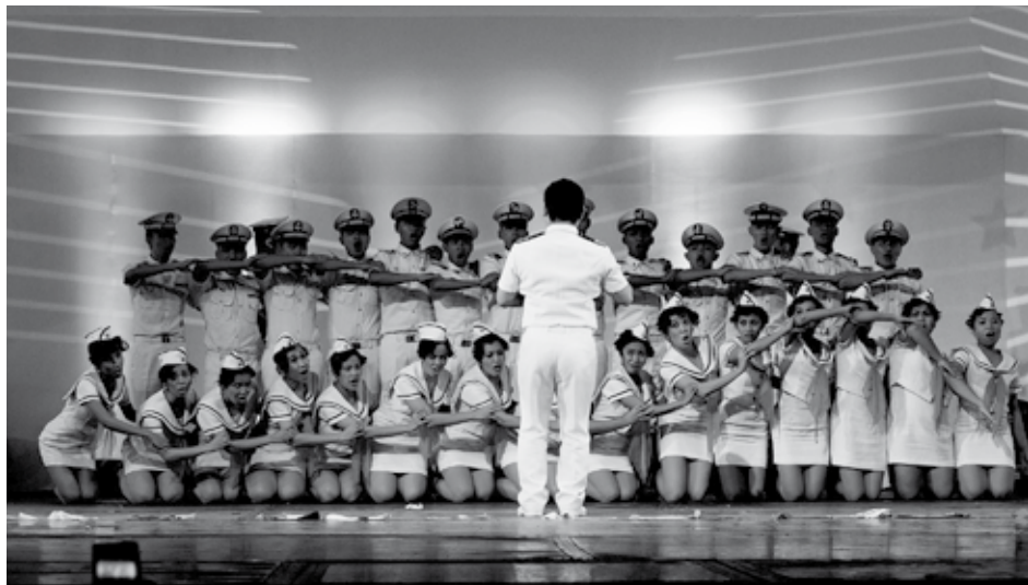
KINAADMAN CHORALE Iloilo City, Philippines