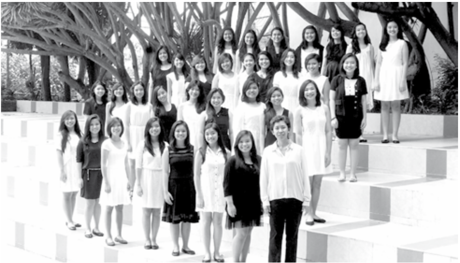
ST. PAUL COLLEGE PASIG HIGH SCHOOL CHORALE Pasig City, Philippines