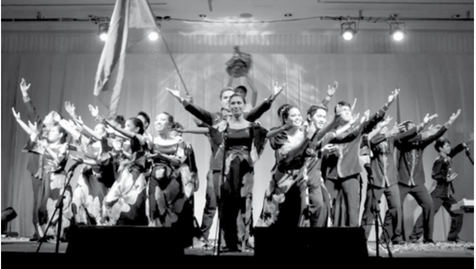
TABOR HILL COLLEGE (OAD) CHOIR Cebu City, Philippines