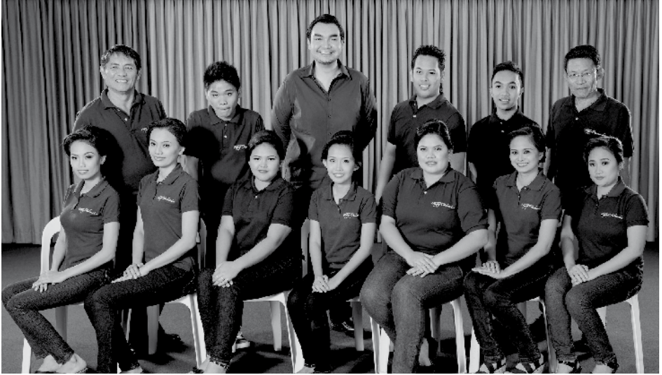
SOUTHERN LEYTE SINGING AMBASSADORS Maasin City , Southern Leyte, Philippines