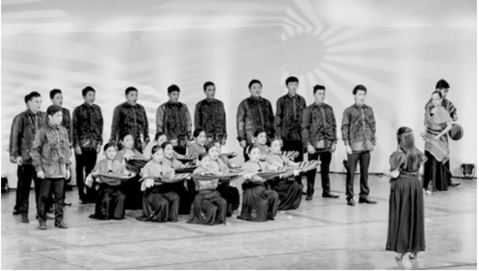
SAINT MARY'S UNIVERSITY CHORAL SOCIETY Bayombong, Nueva Vizcaya, Philippines