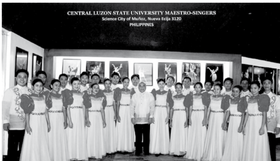
CLSU MAESTRO SINGERS Science City of Munoz, Nueva Ecija, Philippines