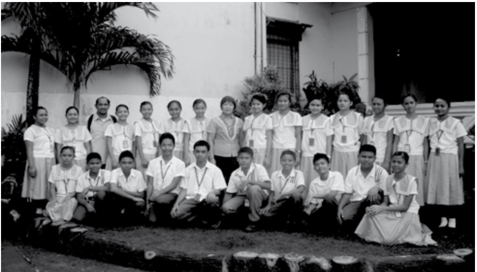
SPA MUSIC ENSEMBLE Oton, Iloilo, Philippines