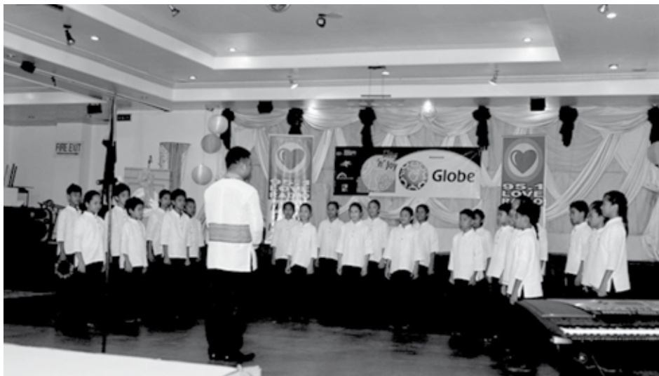
AGOO CHILDREN'S CHOIR Agoo, La Union, Philippines