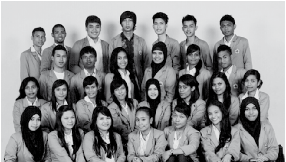
STIKMA CHOIR Makassar, Indonesia