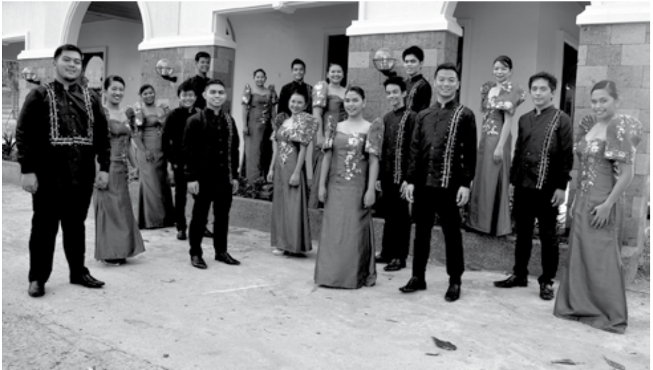
CORO AMADEO Cainta, Rizal, Philippines