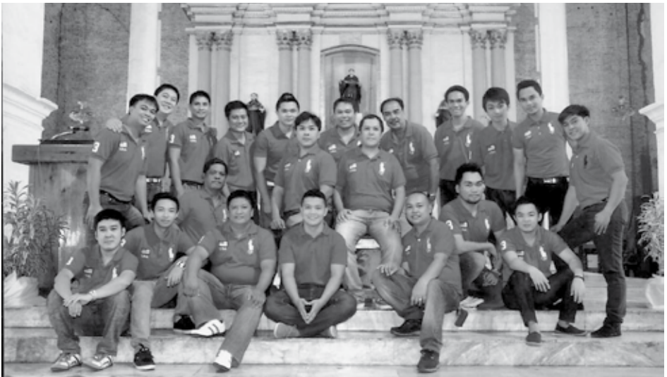
CORO SAN NICOLEÑO San Nicolas, Ilocos Norte, Philippines