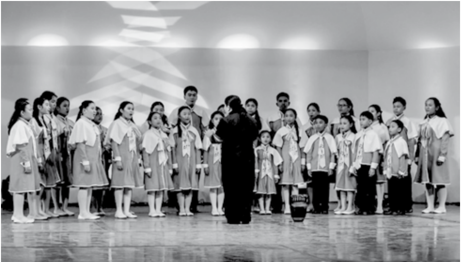
ST. PAUL COLLEGE OF PARAÑAQUE HIMIG BULILIT CHOIR Parañaque, Philippines