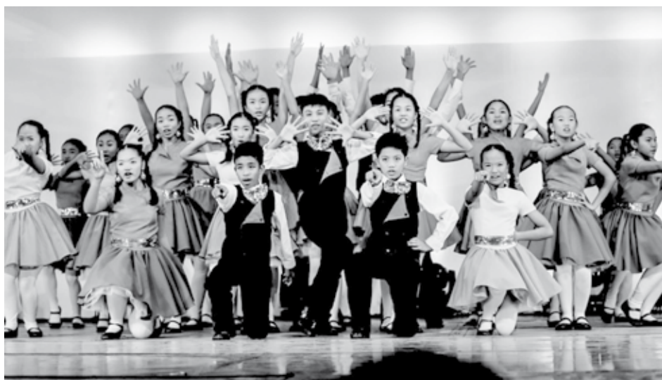
LAOAG CITY CHILDREN'S CHOIR Laoag City, Philippines