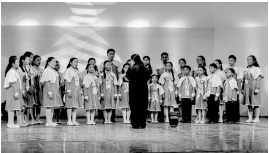
EKKLESIA POLEWALI MANDAR Polewali, Indonesia